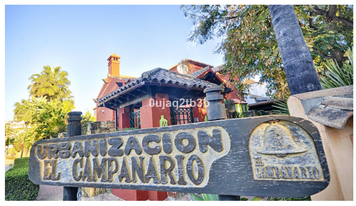
Спальни: 3 Статус: Продажа