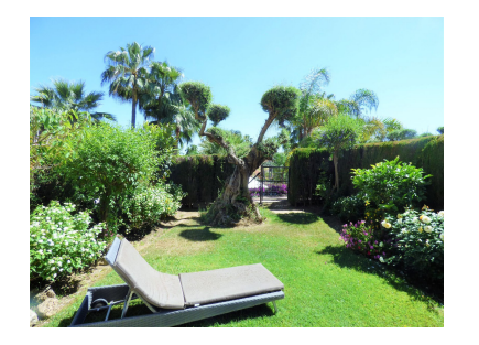
Price: 1,150,000 € Printing day : 6th September 2025

M<sup>2</sup>: 220 Parking places: by request