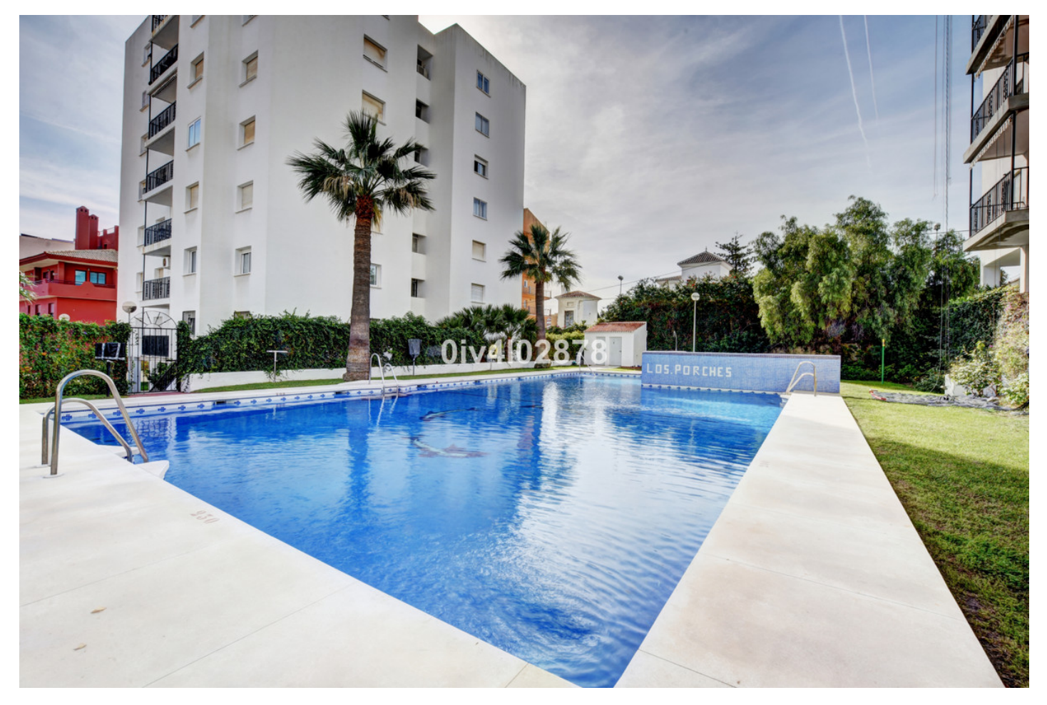
Bedrooms: 3 Status: Sale